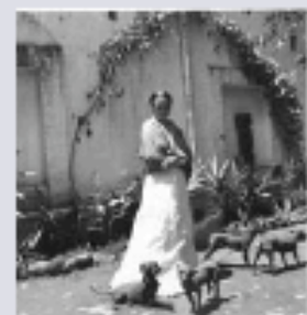
Frida Kahlo et ses chiens, Mexico City, 1948. Ph. n&b, 37x 35 cm - r° : signature, timbre soc / v° : cachet