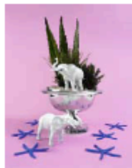
William Sweetlove, 2 White Elephants, 2010, print sur tolie, 110x80 cm.